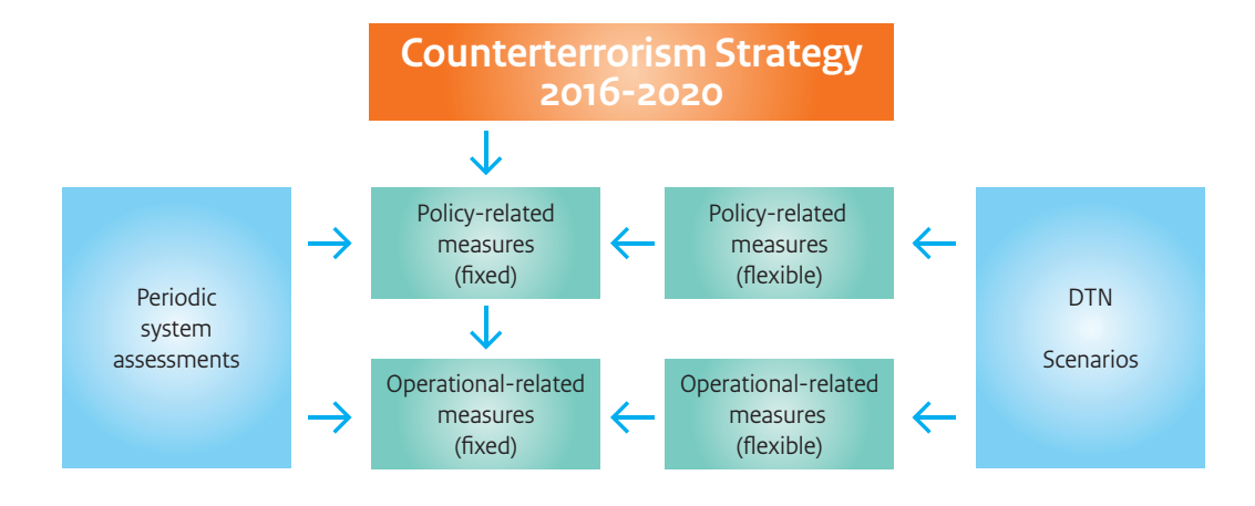
12 There is no separate threat level for extremism. The extremist threat is also discussed in the DTN.

The following diagram shows how strategy, assessment, and fixed and flexible commitments are connected: