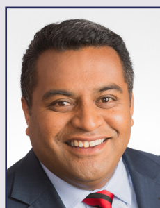
Hon Kris Faafoi

I look forward to working with you all to achieve our vision of New Zealand being confident and secure in the digital world – enabling New Zealand and all New Zealanders – to thrive online.